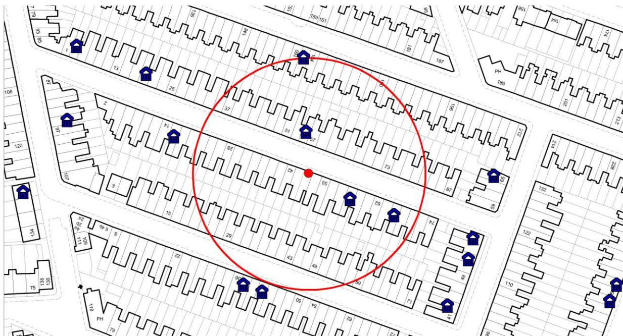
Map B: Identifying properties in HMO use