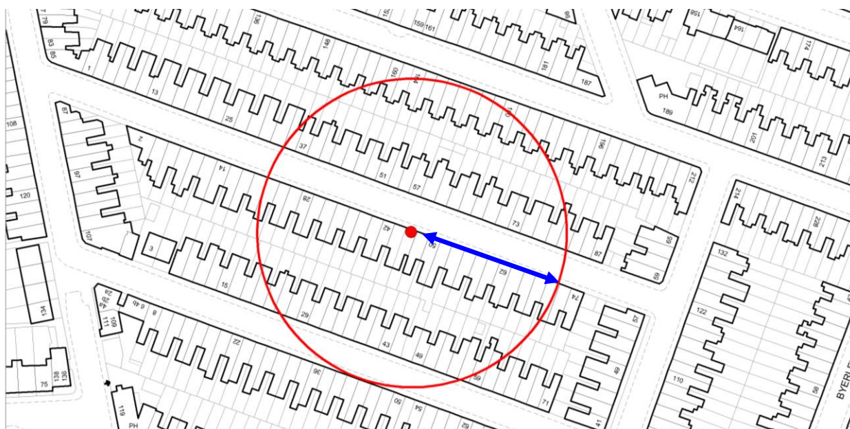
Figure 1: Houses - identifying 'the area surrounding the application property'